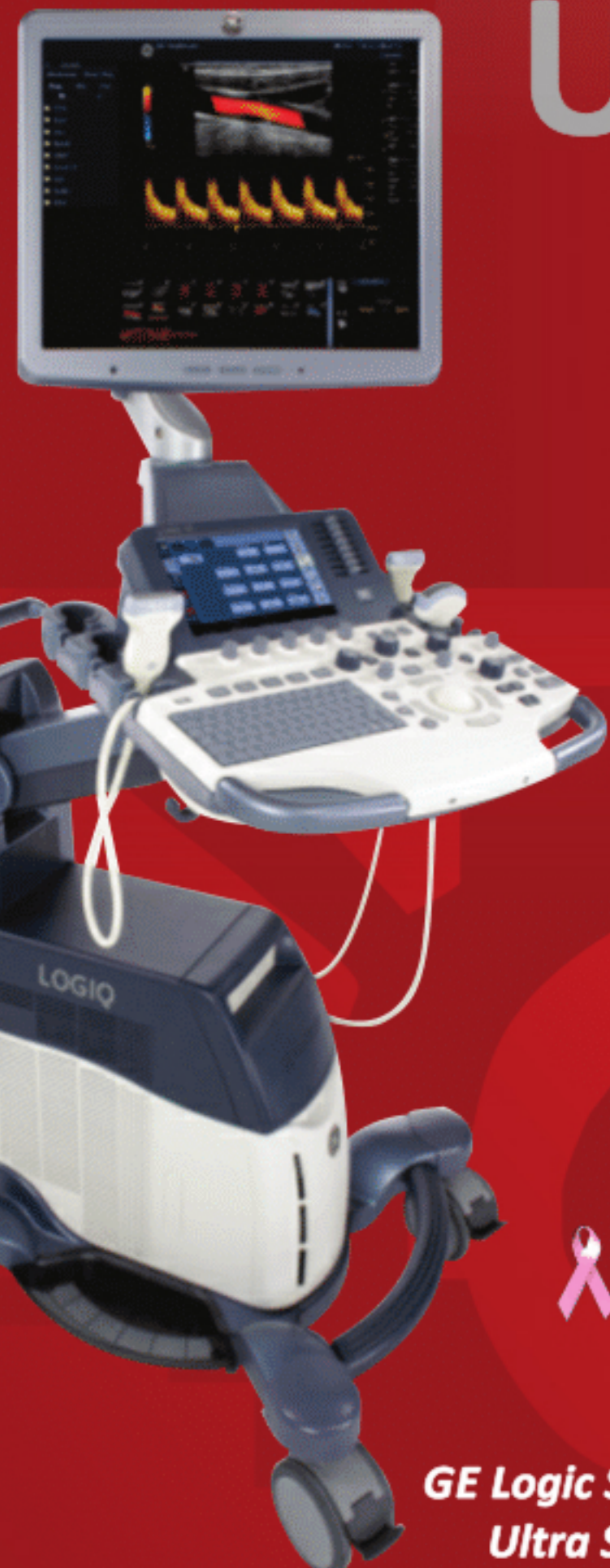
GE Logic S7 Expert Ultra Sound